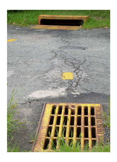
ST-12, Edith Decker School (continued)