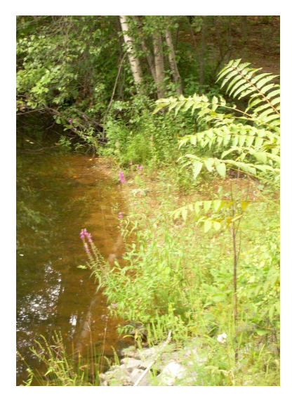
ST-14, First Bridge on Three Rivers Drive (continued)