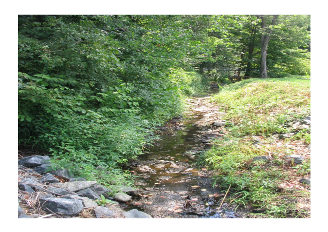
ST-3, Benedict's Lagoon (continued)